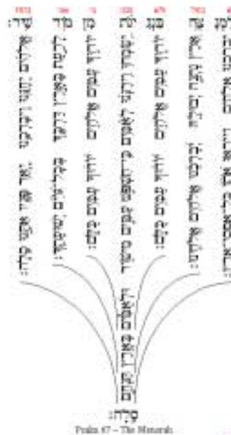
Psalm 67 - The Menorah

Sponsored by: Artists in Christian Testimony